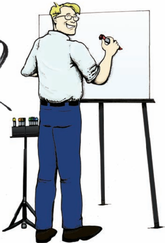
ILLUSTRATION BY JAY SMETHURST AND CHRISTOPHER FULLER